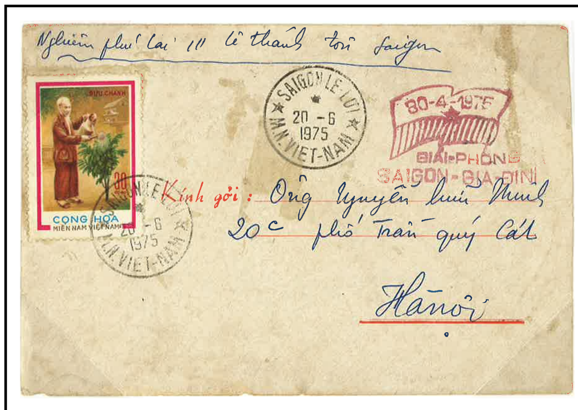
Saigon - Le Loi to Hanoi, 20 June 1975, with PRG Issue 17. Postage: 30 dong for 20 gram letter. Large (16mm x 33mm) Saigon Liberation hand-stamp. Type 2 M.N. Viet Nam cancel.