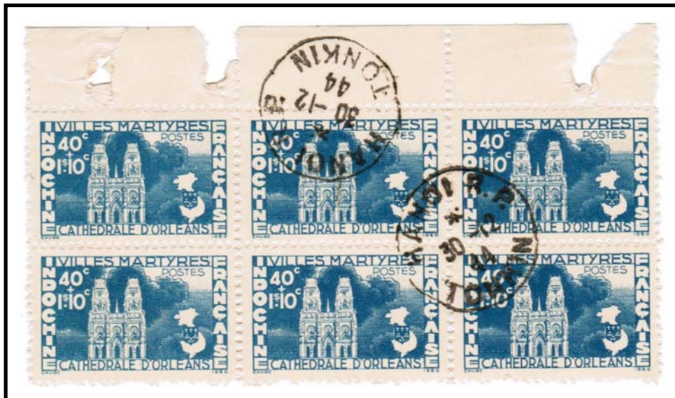
HANOI R.P. TONKIN