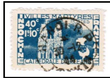
HANOI R.P. TONKIN