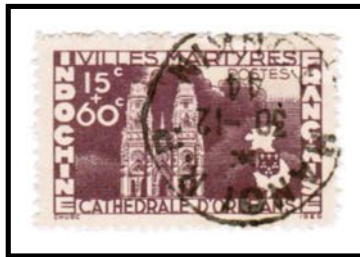
HANOI R.P. TONKIN