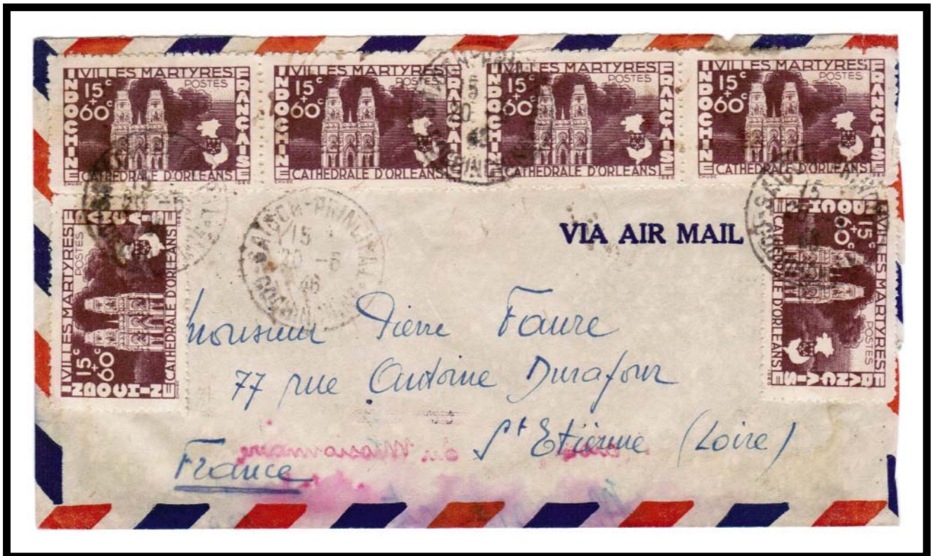
POSTAL MARKINGS SAIGON R.P. COCHINCHINE 20-5 46