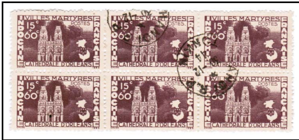
HANOI R.P. TONKIN