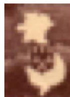
WITH PROJECTION AT TOP