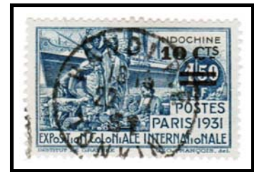
HANOI R.P. TONKIN