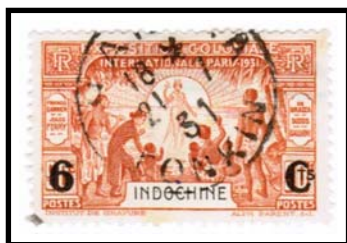
HANOI A TONKIN