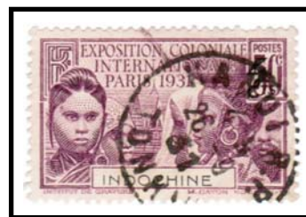
HANOI R.P. TONKIN