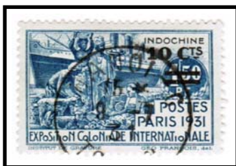
HANOI C TONKIN