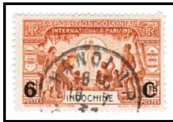
HANOI R.P. TONKIN