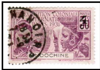
HANOI R.P. TONKIN