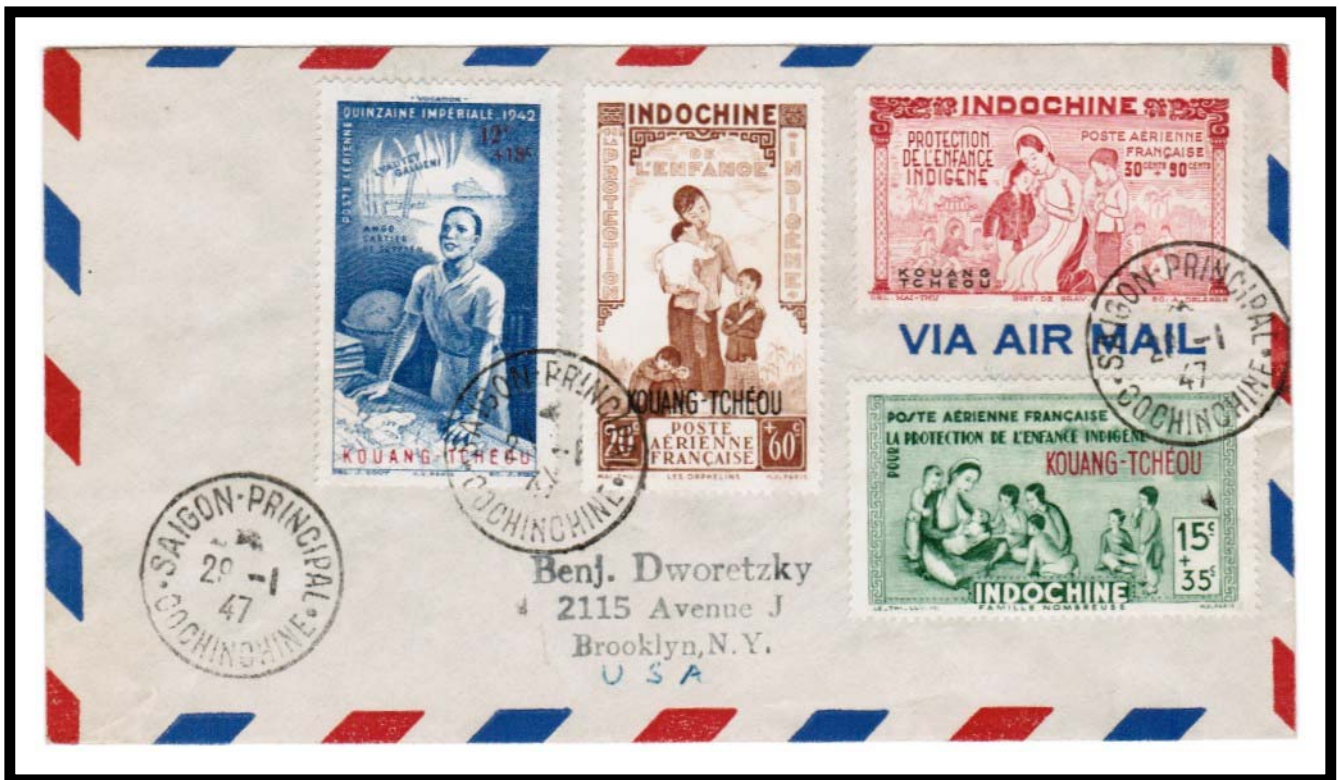
POSTAL MARKINGS SAIGON-PRINCIPAL COCHINCHINE 29-1 47

Posted in 1947, the set of four Kouang Cho Wan semi-postal stamps was accepted as postage for airmail service to the United States.