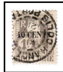
HANOI R.P. COLIS POSTAUX