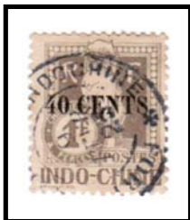
FORT BAYARD INDOCHINE