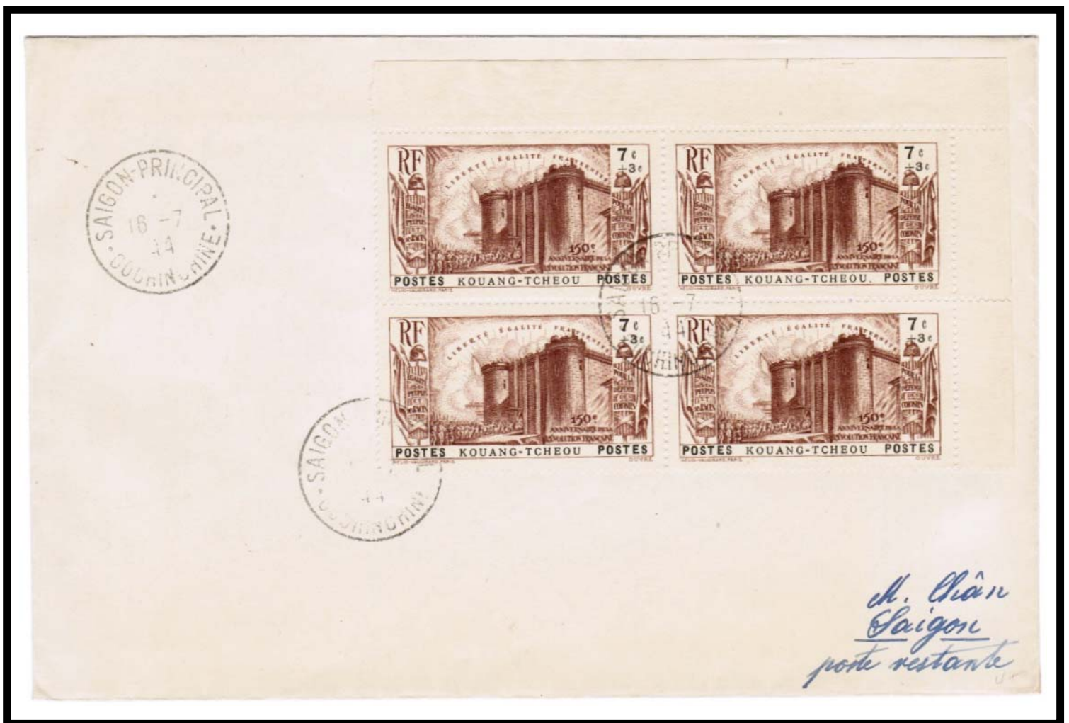
POSTAL MARKINGS SAIGON-PRINCIPAL COCHINCHINE 16-7 44

A block of four 7c + 3c stamps significantly overpaid the internal letter rate of 10 cents in mid-1944.