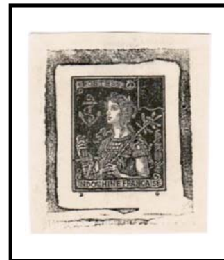
ESSAY FOR INDOCHINA

Design differences are few. Naturally, the French version has “REPUBLIQUE FRANCAISE” at the base as compared to the “INDOCHINE FRANCAISE” with the Indochinese version. On the French essay, the ornament to the left of the figure appears to be a sheaf of wheat with semicircular laurels. (The same symbol, minus the laurels, appears at the right hand side of the design.) The Indochinese version replaced the ornament with an anchor. Other than these differences, all major design elements appear to be the same. Shading on the face and other portions of the figure is more pronounced on the Indochinese essay.