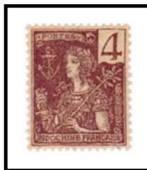
4 centimes in color of 2 centimes