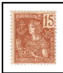
15 centimes in color of 30 centimes