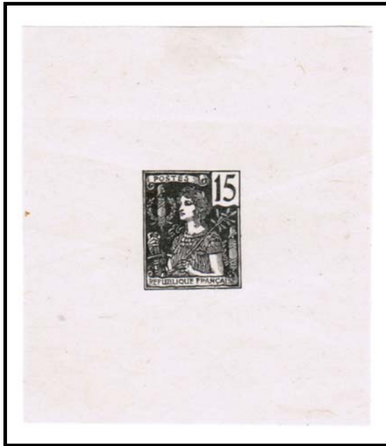
ESSAY FOR FRANCE

Toward the end of 1902 or perhaps early 1903, Governor Paul Doumer was sent essays of a modified Grasset design. Perhaps Doumer saw acceptance of this design as a way to expedite his real goal of locally-denominated stamps or perhaps it was just a case of political arm-twisting. For whatever reason, it was announced that Indochina would issue stamps based on the Grasset allegory.