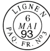
POSTMARK TYPE: 1.921/3 PERIOD OF USE: 1867-96