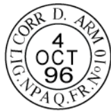
POSTMARK TYPE: 1.949/10 PERIOD OF USE: 1870-98

Upon leaving Saigon aboard the S.S. Sydney on 4 October 1896, this letter received the military maritime postmark reserved for soldier's mail. Addressed to Madagascar, the mailing was later struck with a "MARSEILLE A LA REUNION" maritime postmark after it was transferred to the S.S. Djemnah outbound from Marseilles.