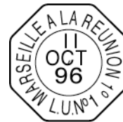
POSTMARK TYPE: 2.321/1 PERIOD OF USE: 1896-1912