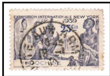
POSTE AUX ARMEES