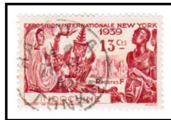
HANOI A TONKIN