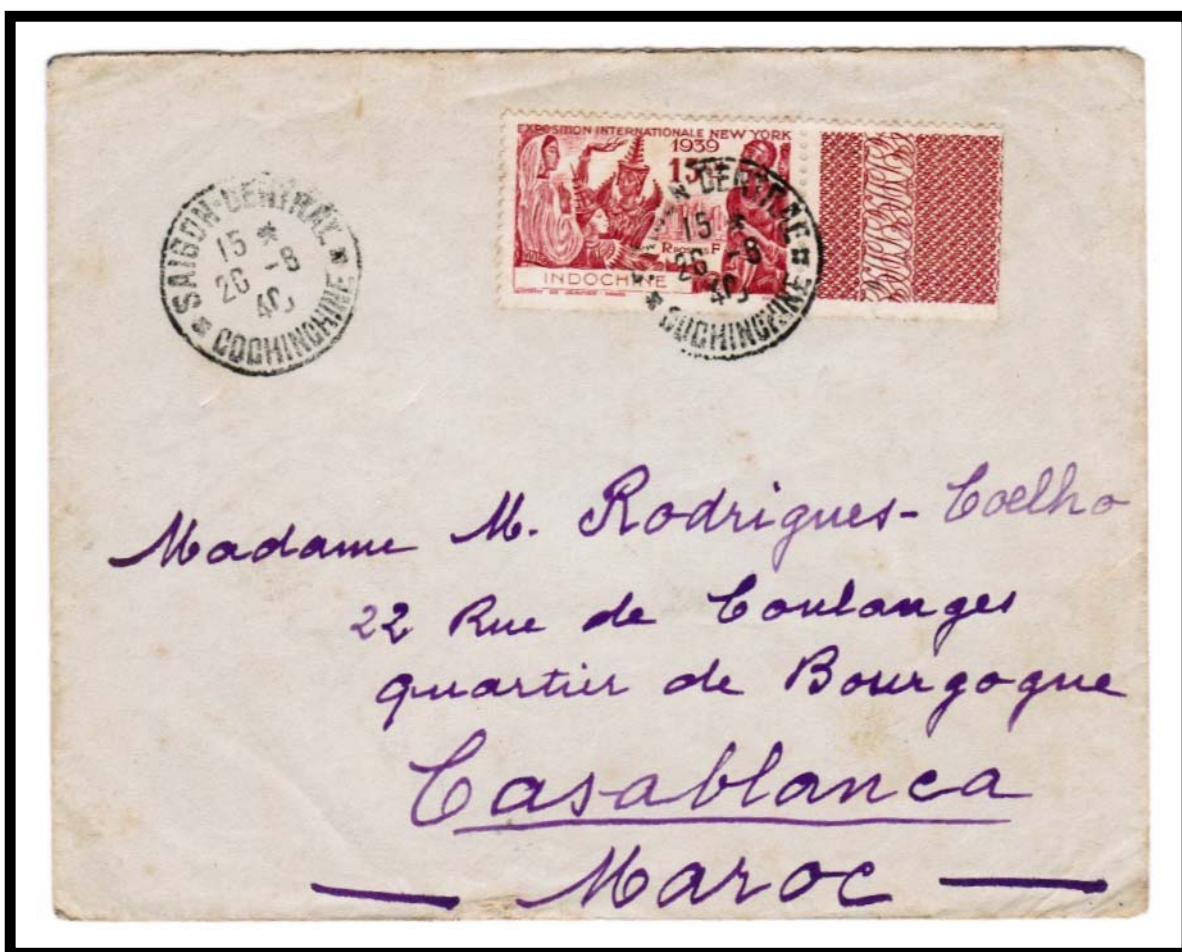
POSTAL MARKINGS SAIGON-CENTRAL COCHINCHINE 20-5 40

The postal rate adjustments of 22 March 1939 increased the rate for foreign letters to 23 cents. The rate for France and colonies was only 9 cents for the first 10 grams. Nonetheless, in this case, the sender chose to affix a 13-cent commemorative stamp for his mailing to Morocco in 1940.