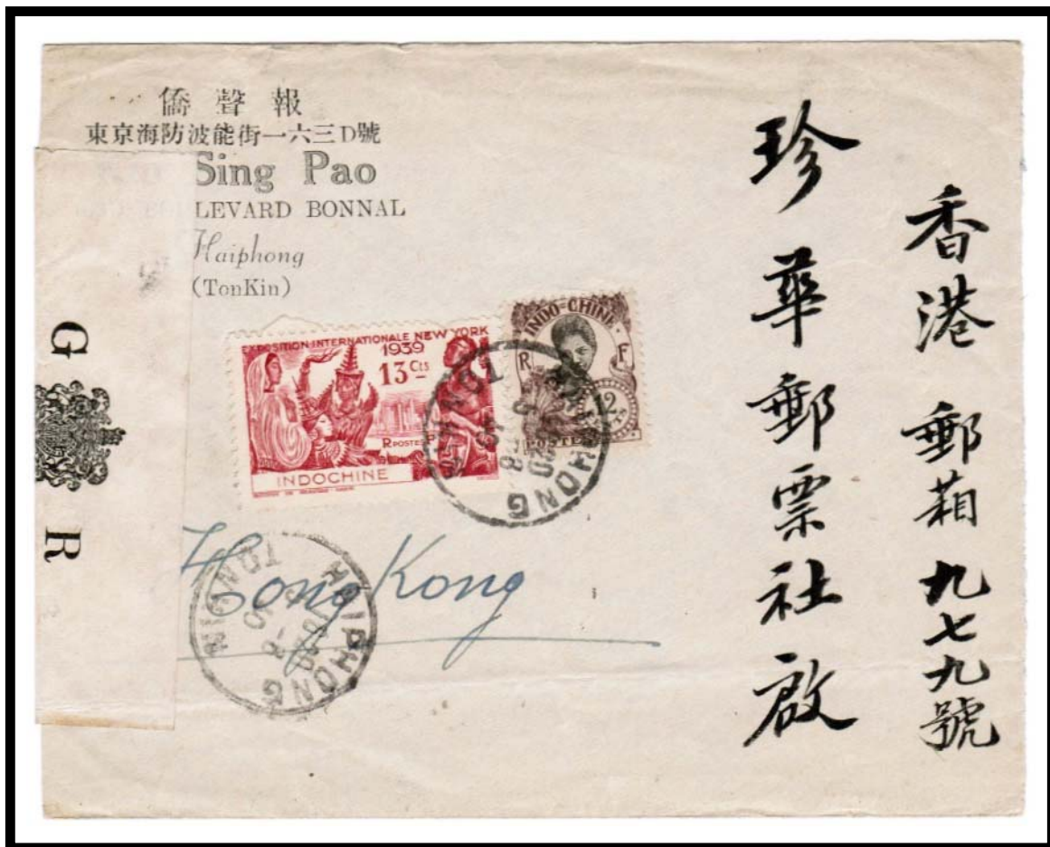
POSTAL MARKINGS HAIPHONG TONKIN 5-8 40 censor's resealing tape (Hong Kong)

The 13 cent New York World's Fair stamp contributed to the postage for a wartime mailing to Hong Kong in 1940. Upon receipt, the envelope was opened so that the censors could examine the contents.