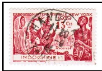
HANOI R.P. TONKIN