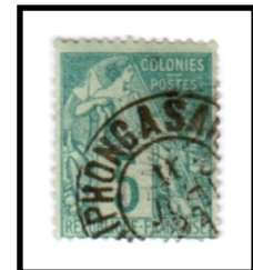
HAIPHONG A SAIGON PAQ. FR.