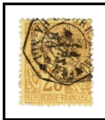
CORR. D. ARMEES HA-NOI