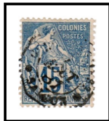
CORR. D. ARMEES SAIGON