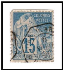
CORR. D. ARM. PNOM PENH