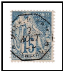
CORR. D. ARMEES SADEC