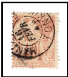
HANOI-REC TE TONKIN