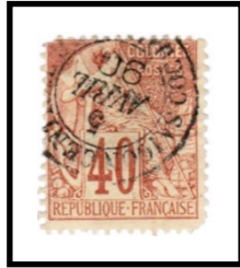
SAIGON CENTRAL COCHINCHINE