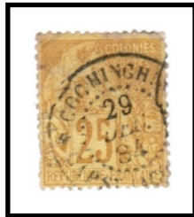
COCHINCHINE CAP ST JACQUES