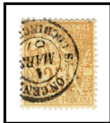
SAIGON CENTRAL COCHINCHINE