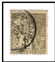
SAIGON CAL COCHINCHINE