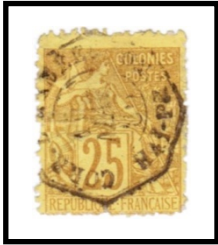
CORR. D. ARMEES HAI-PHONG