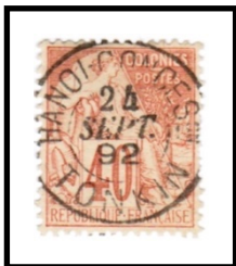
HANOI-CONCES ON TONKIN