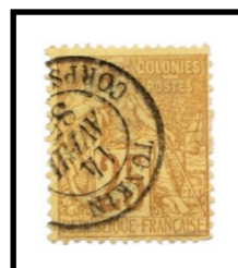
TONKIN CORPS EXPEDITRE