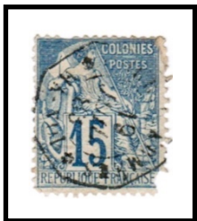
CORR. D. ARMEES HA-NOI