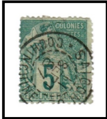
SAIGON CAL COCHINCHINE