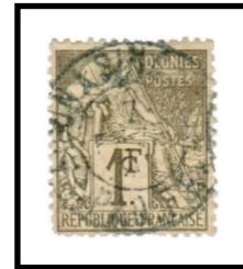
SAIGON A SINGAPORE PAQ. FR.