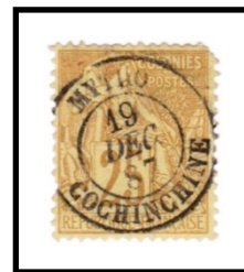
MY THO COCHINCHINE