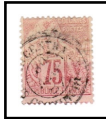
SAIGON CENTRAL COCHINCHINE