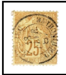
BAC LIEU COCHINCHINE