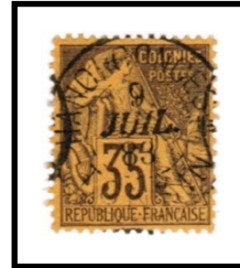
HANOI-CONCES ON TONKIN