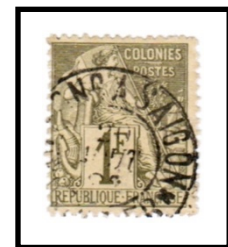
HAIPHONG A SAIGON PAQ. FR.