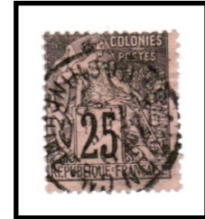
SAIGON CAL COCHINCHINE