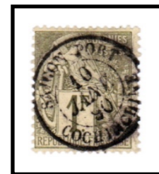
SAIGON PORT COCHINCHINE