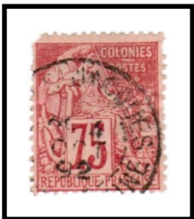
CAP ST JACQUES COCHINCHINE