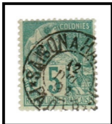
SAIGON A HAIPHONG PAQ. FR.