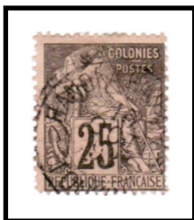
HANOI A HAIPHONG TONKIN