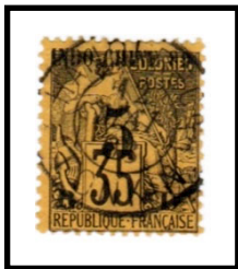
HANOI RECTE TONKIN