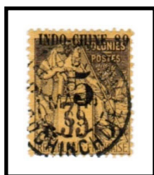
SAIGON CAL COCHINCHINE