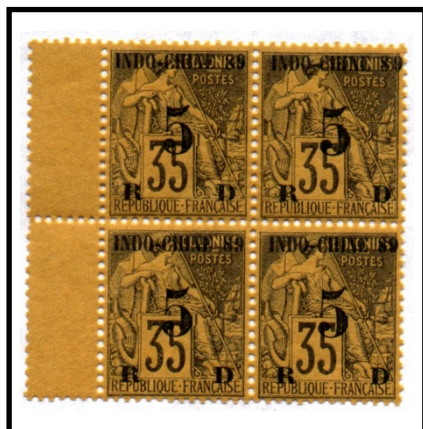
widely spaced "8 9" (upper right)