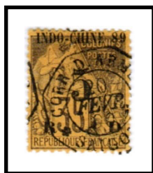
CORR. D. ARMEES SAIGON