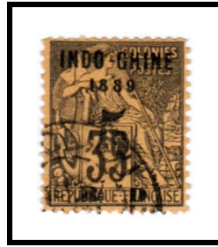
Facsimile of the small "1889" overprint in black.