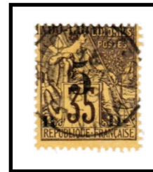
HANOI-CONCES ON TONKIN