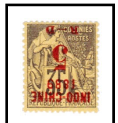
Facsimile of the inverted overprint in red.