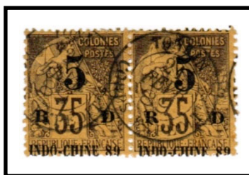
TONKIN CORPS EXPEDITRE (shifted overprint)