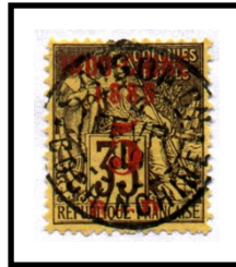
SAIGON CAL COCHINCHINE