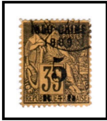
Facsimile of the large "1889" overprint in black.