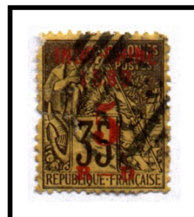
B62 (HONG KONG)