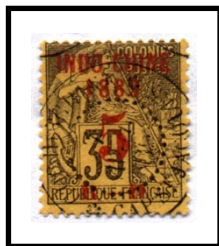
CAP St. JACQUES COCHINCHINE