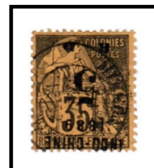
Facsimile of the inverted large "1889" overprint in black.