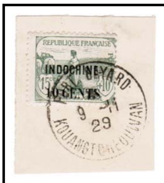
FORT BAYARD KOUANGTCHEOUWAN