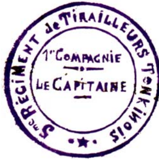
5 th Regiment Tonkin Skirmishers

As evidenced by the military cachets, Kouangchowan had troops assigned to various locations. Other troops must have rotated through Kouangchowan as this cover demonstrates. The cachet clearly belongs to a regiment based in Tonkin. The letter was postmarked at Fort Bayard in 1903.