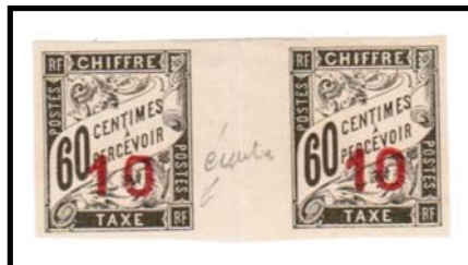
Wide and normal spacing