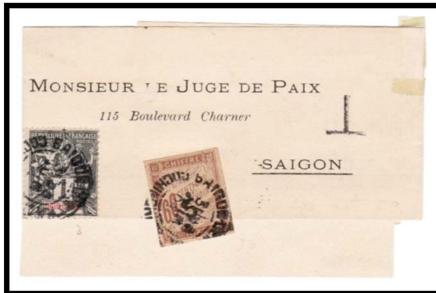
POSTAL MARKINGS SAIGON-CENTRAL COCHINCHINE 25 JUN 04 large plain "T" SAIGON-CENTRAL COCHINCHINE 26 JUN 04