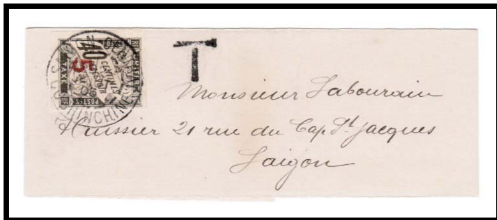
POSTAL MARKINGS SAIGON-CENTRAL COCHINCHINE 28 AOUT 05 large, plain "T" (postage due)

In 1905, the sender failed to add any postage to a wrapper addressed locally within Saigon. As a consequence, a postal clerk applied a large "T" with black ink. Additionally, he affixed a 5-centime postage due stamp for the minimum postage due amount.