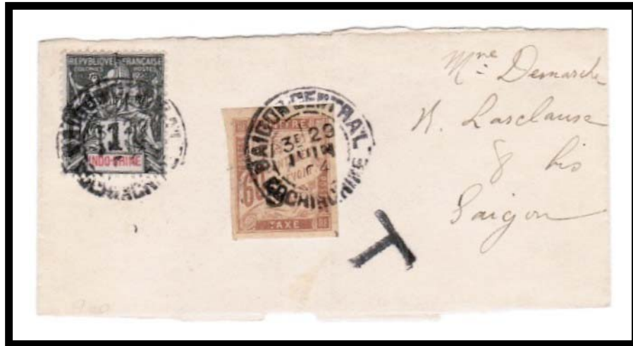
POSTAL MARKINGS SAIGON-CENTRAL COCHINCHINE 29 JUN 04 large plain "T"

One-centime stamps were insufficient postage for these wrappers mailed internally within Saigon in 1904.